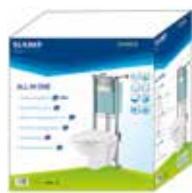
COMPLETE PACK IN 1 BOX